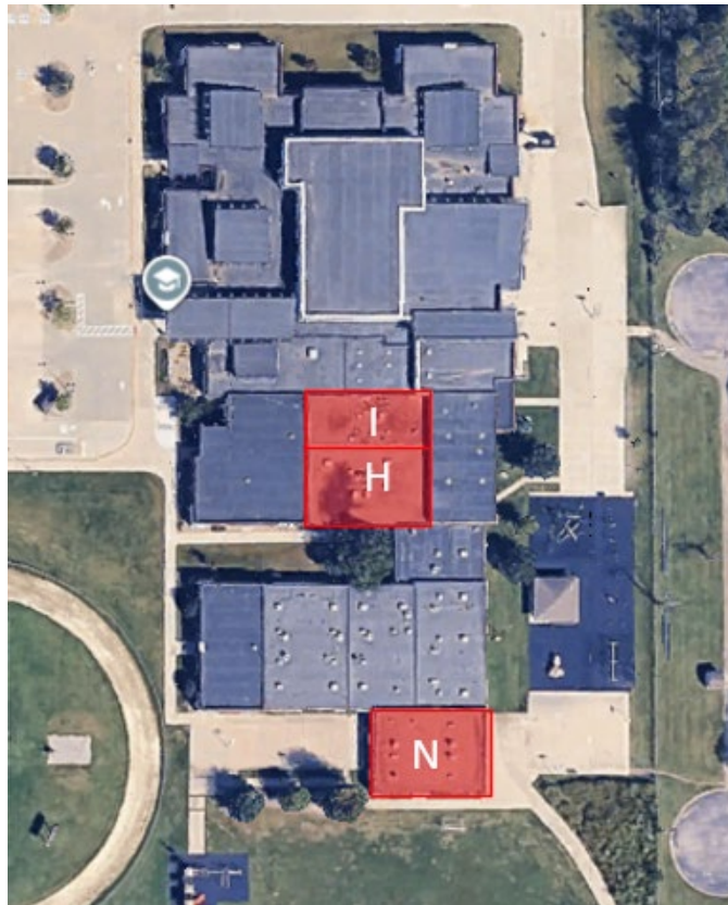
Hansen Elementary – Sections I, H, & N