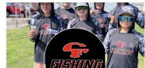
CF Fishing Team @cffishingteam